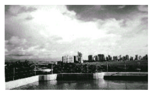
View of the "New City" from a rooftop pool.

If you wish to make arrangements with your colleagues to meet them upon arrival in Cartagena, all hotels have restaurants and lounges that would be suitable!