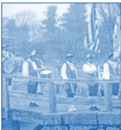
Patriots Day •

This special one-day program is being co-sponsored by the American Bar Association's Section of Environment, Energy & Resources, the nation's leading organization of environmental lawyers, in partnership with the other co-sponsors and the International Association of Impact Assessment, the largest international association of its kind, on the occasion of the 25 th Anniversary of IAIA.