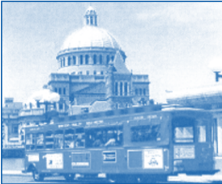
Beantown Trolley

A pproximately twenty states have their own programs for preparing environmental impact assessments of proposed governmental and private actions. These are often called “little NEPAs,” but in the aggregate, they are responsible for the preparation of far more impact assessments than are created under the National Environmental Policy Act.