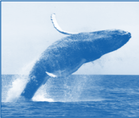
Jumping whale.