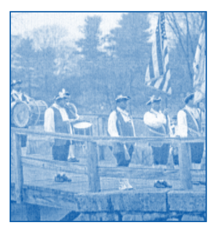
Patriots Day

This special one-day program is being co-sponsored by the American Bar Association's Section of Environment, Energy & Resources, the nation's leading organization of environmental lawyers, in partnership with the other co-sponsors and the International Association of Impact Assessment, the largest international association of its kind, on the occasion of the 25<sup>th</sup> Anniversary of IAIA.