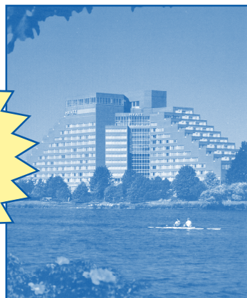
Hyatt Regency Cambridge