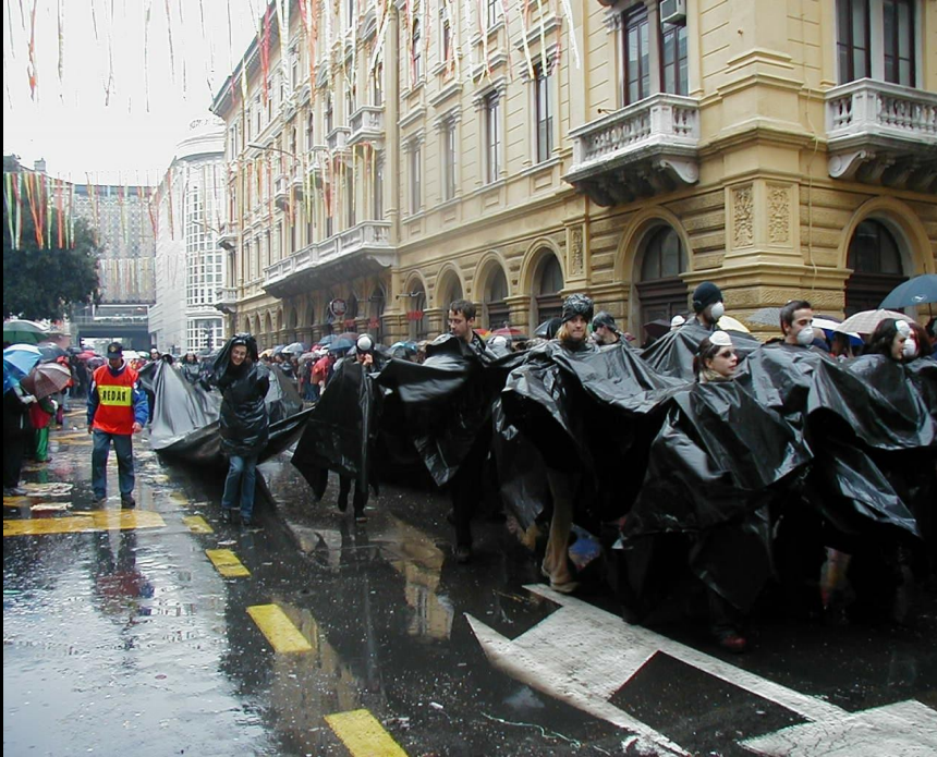
Carnival procession entitled “Druzhba Mafia” – procession detail: huge oil stain”

The campaign against the project developed in parallel with the official EIA procedure. Even though both lasted over 3 years, the public never officially participated in the EIA procedure. The Croatian legislation does not foresee public participation until a very late stage of the procedure. That stage of public participation was never reached in the case of Druzhba-Adria.