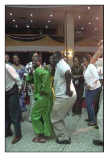
A conga line forms while the band plays following the banquet.